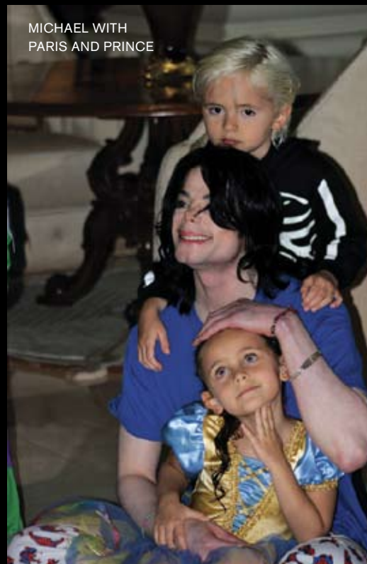
MICHAEL WITH PARIS AND PRINCE