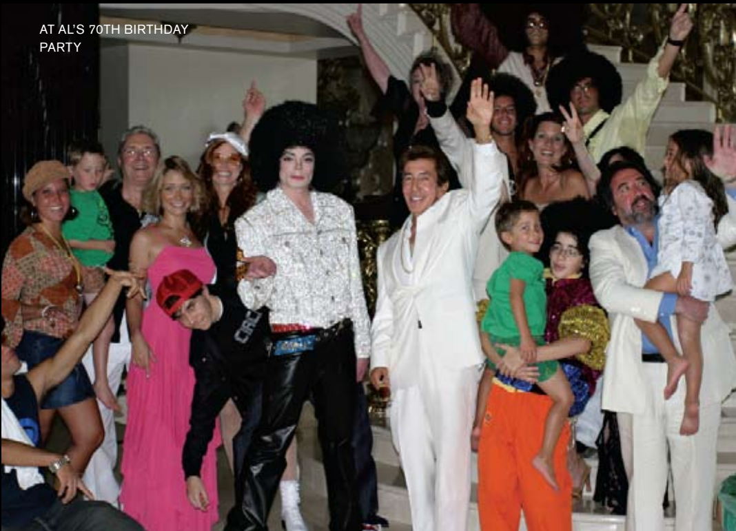
AT AL'S 70TH BIRTHDAY PARTY