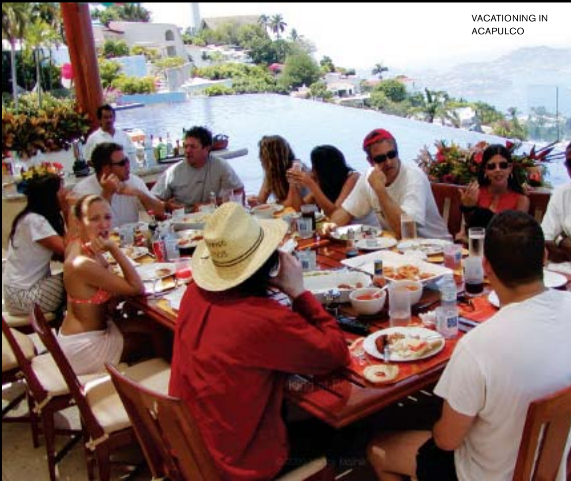
VACATIONING IN ACAPULCO