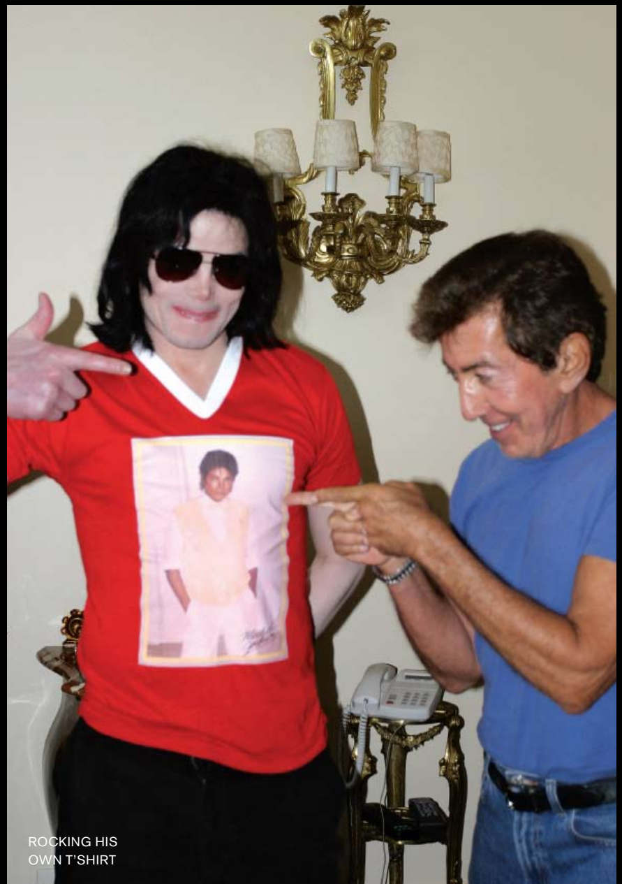
ROCKING HIS OWN T-SHIRT