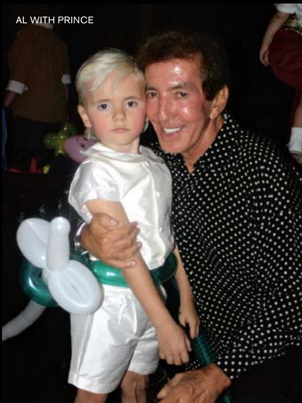
AL WITH PRINCE

another. I asked him, “What are you doing?” up this set doing one song, and when I walk song in five minutes, it was unbelievable.