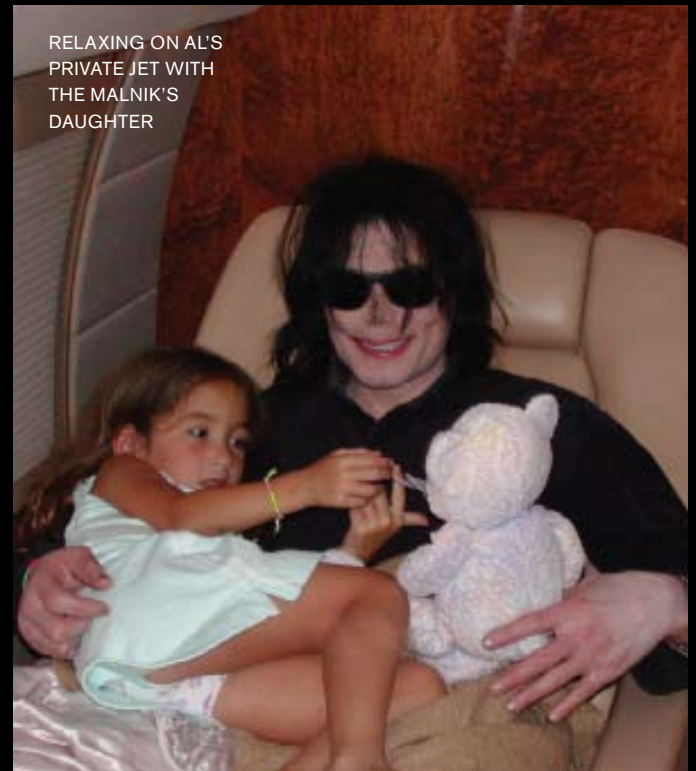
RELAXING ON AL'S PRIVATE JET WITH THE MALNIK'S DAUGHTER