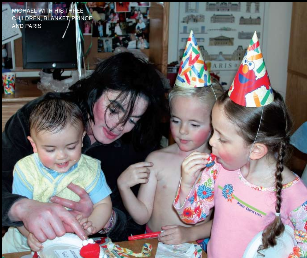
MICHAEL WITH HIS THREE CHILDREN, BLANKET, PRINCE, AND PARIS