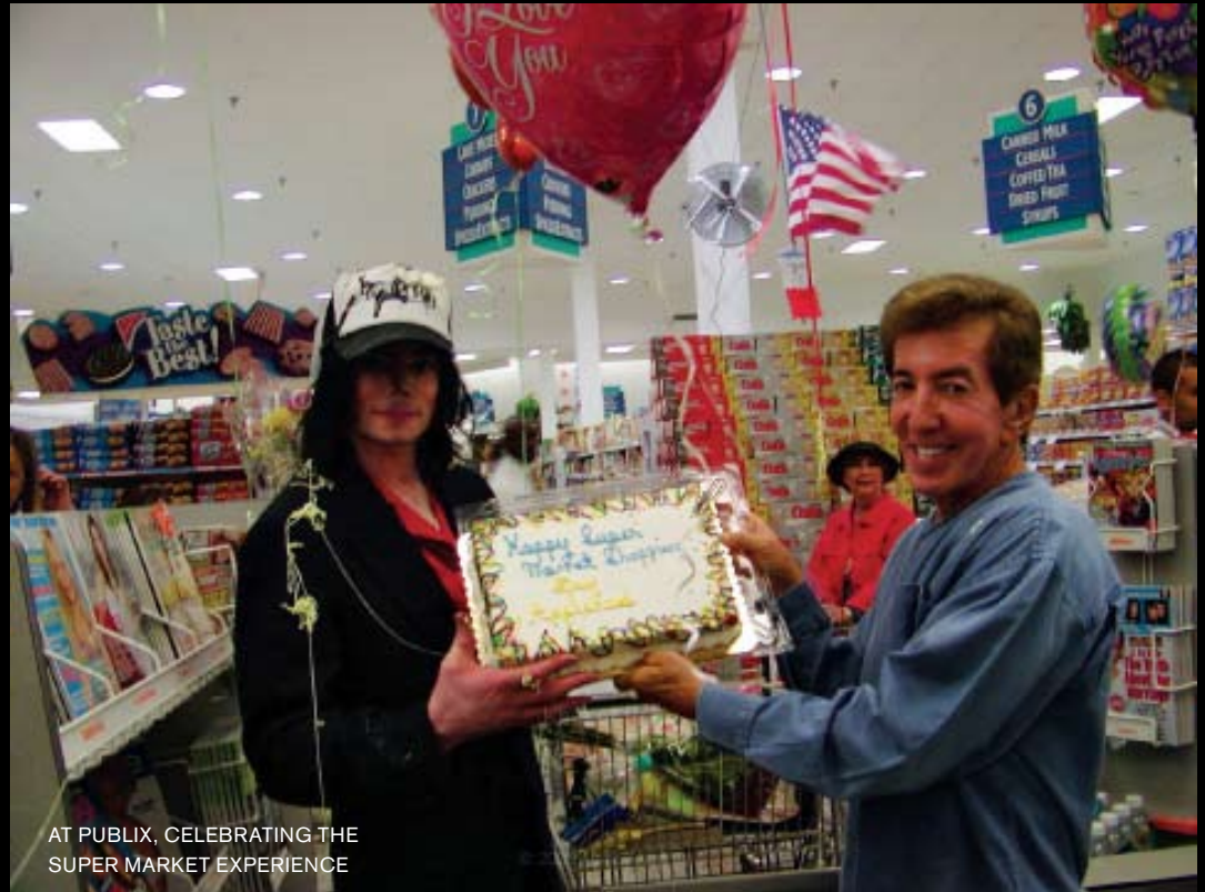
AT PUBLIX, CELEBRATING THE SUPER MARKET EXPERIENCE